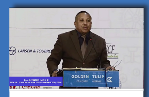
Story page 5