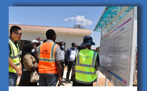
Story page 4